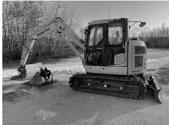
The Highway Department's new Komatsu excavator.