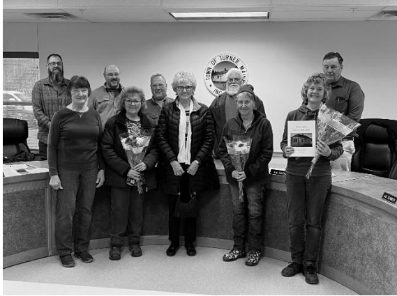
Selectmen present an advance copy of last year's Town Report to the fundraisers for the North Turner Community Center window replacement project. Last year's report was dedicated to the group, and the new windows were installed last spring.