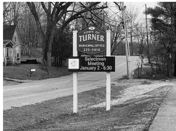
A portion of the town's ARPA funding was used to add an electronic message sign at the Town Office. The sign is used to announce public meetings and official events.