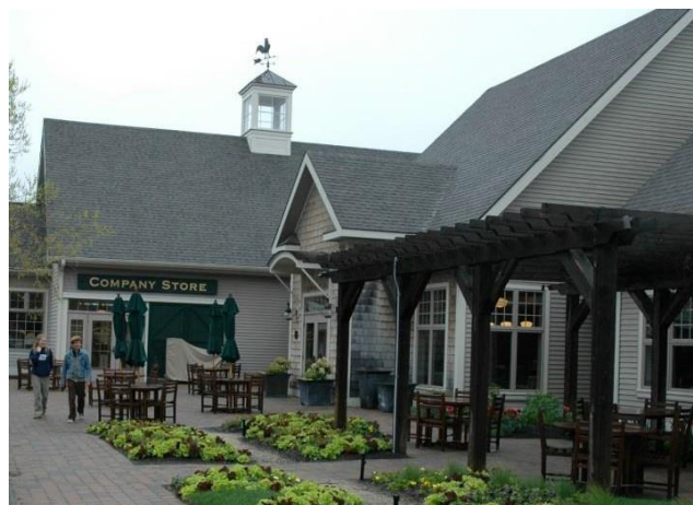
The cupola projecting from this pitched roof is an example of traditional forms used in a contemporary structure.

Preferred Materials for Visible Roofs. Composite asphalt shingles and standing-seam non-glare metal are acceptable for visible roofing. High gloss roofing materials should not be used.