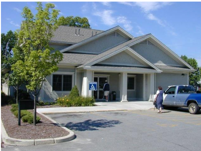
Three views of a branch bank set in a mixed-residential neighborhood. All facades were treated with equal importance. The front (top photo) faces the street and is built to the sidewalk, providing a welcoming presence to pedestrian traffic. The side of the building (middle photo), facing a single family home, is residential in scale and design. The canopy over the rear entrance (bottom photo) provides a transition area between the parking lot and the doorway.