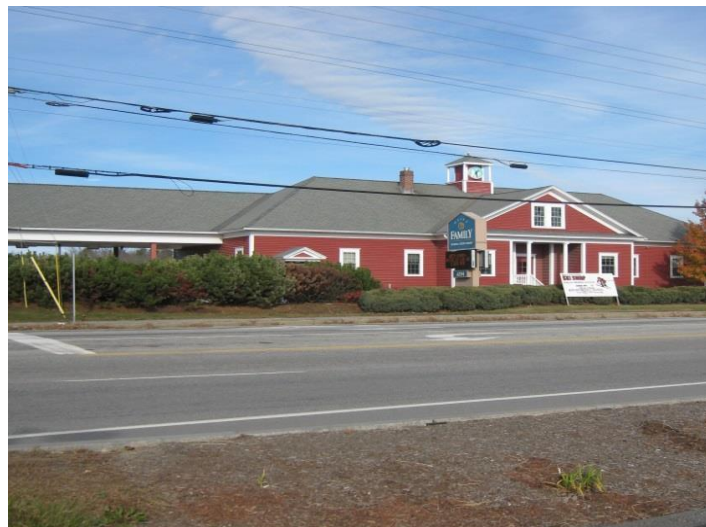
A former school house was transformed into bank with drive up window adding interest and variety to the streetscape.

Architectural Features. Renovations should retain any distinctive architectural features or examples of skilled craftsmanship. Where such features occur, similar details should be incorporated into the addition where possible.