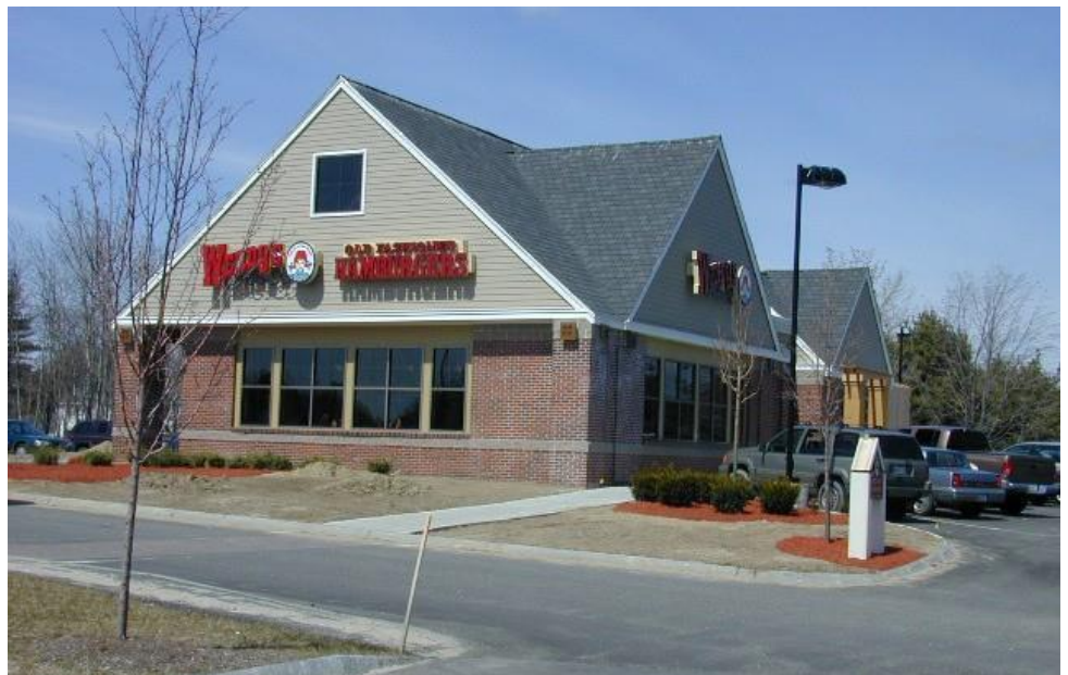
A restaurant that was designed to complement the vision for a Rural highway corridor.