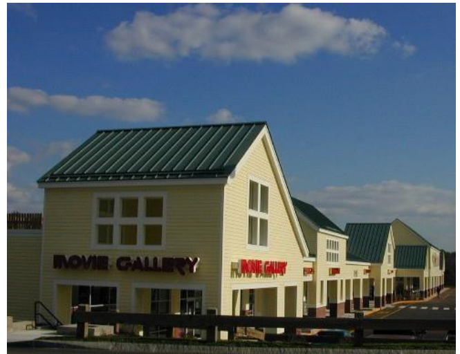
This smaller retail store attached to a large grocery has been designed as an individual building, with a separate entrance and architectural detailing. A covered walkway connects all the storefronts.

Cart Storage. Shopping carts must be stored inside the building, or in ‘cart corrals’, out of the way of pedestrian circulation. Where cart corrals are proposed they should be subject to the design standards for accessory structures.