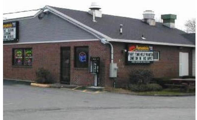
HVAC equipment and service connections are highly visible, adding unnecessary clutter to this small restaurant.