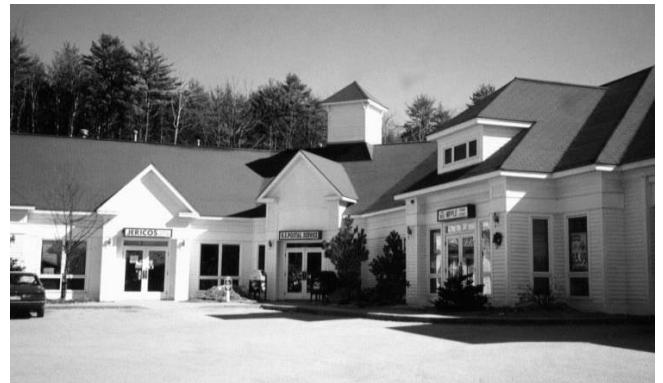
The scale of this commercial building has been effectively reduced through variations in its roofline and projecting gables.