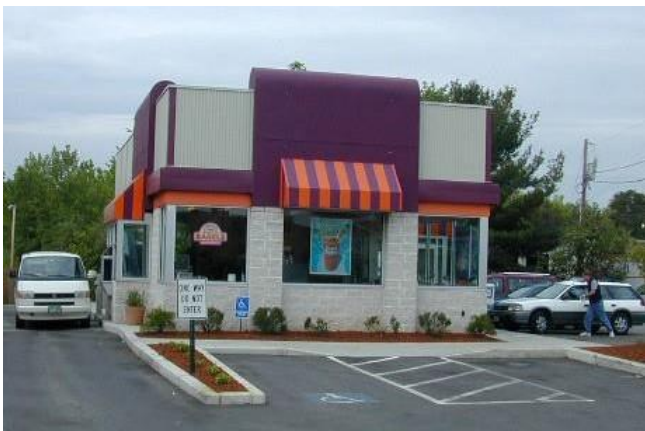
Corrugated plastic panels