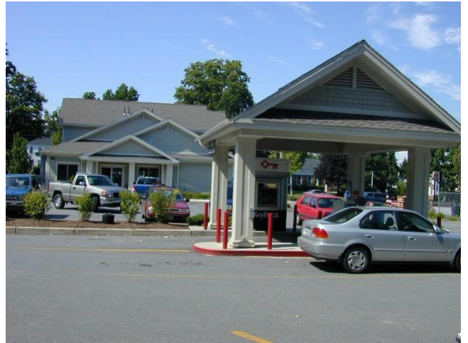
The design of this successful drive-through repeats the same roof pitch, forms, and materials found in the main bank building.

Site Planning. The location of all accessory structures should be illustrated on the site plan to show how they will be coordinated with plans for circulation, landscaping, lighting, parking, and other site features.