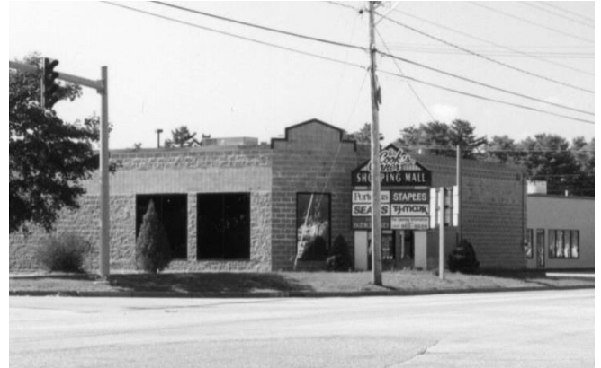
Split face block