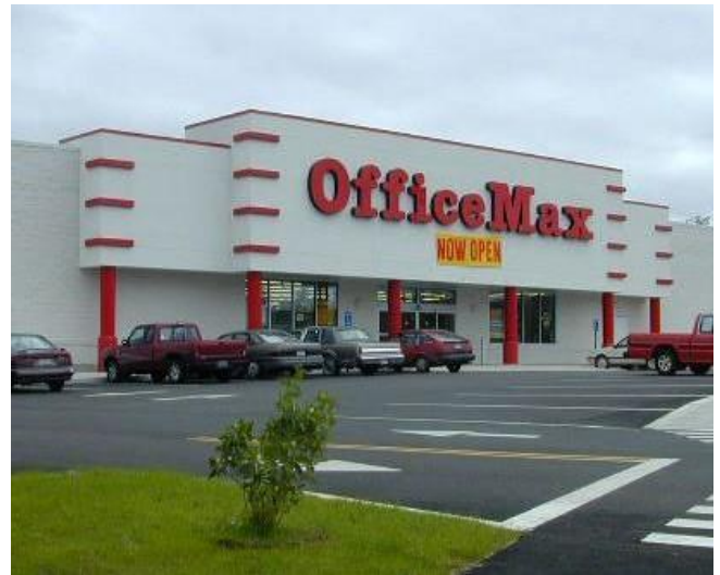
While the front plane of the wall of this building is broken, the offset does not continue to the ground. The projection becomes a billboard and the building is seen as a large box.