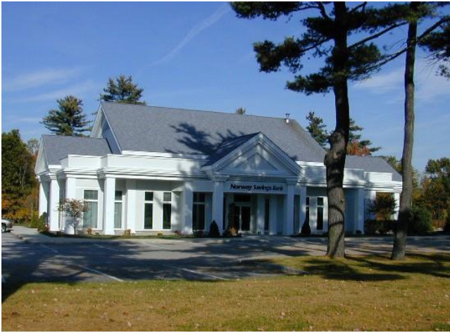
Many elements of New England architecture – pitched roof, gable ends, overhanging roof – are used in this attractive bank building.