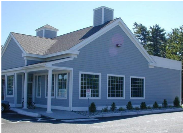
The facade treatment on this shop wraps around the corner to present a unified design from all visible faces. The entrance is emphasized by columns and the lower roofline.

Street Facades. For retail structures, any facade that faces public or private streets should have display windows, entry areas, or other transparent features. As an alternative, other features may be used to provide scale and visual interest to the front facade, as long as they are integrated into the design of the building by color, form, materials, and architectural design.