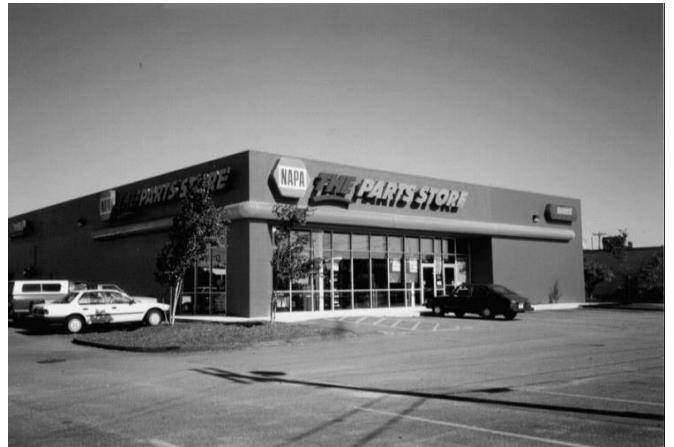
This building pays little attention to the site where it is located, nor gives much attention to detailing and the roofline. Flat roofs such as this are discouraged.