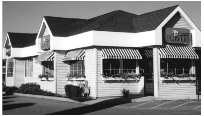
Awnings can be used effectively to add scale, visual interest and provide shade to the building facade.

Design Elements. Graphics used on awnings for identification or advertising should be designed as an integral part of the signage for the property, and be coordinated with other sign elements in terms of type- face, color, and spacing. Awnings should not be used as advertising features or light sources. Internally lit awnings are discouraged.