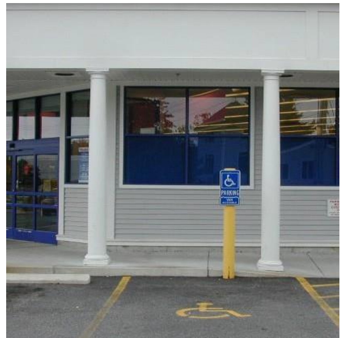
Details are critical to maintain long-term value. Plastic columns in this example are susceptible to snowplow damage. Bases are not flush with the pavement.

Functional Elements. All vents, downspouts, flashing, electrical conduits, meters, HVAC equipment, service connections, and other functional elements should be treated as integral parts of the architecture, starting at the conceptual building design phase. When these elements need to be part of the facade (e.g., downspouts, vents) they should be incorporated into the architecture through detailing or matching colors. Meters, utility banks, HVAC equipment, and other exterior service elements should be located out of view from the public. Building elevations which show the location and treatment of all functional elements should be presented for Planning Board review.