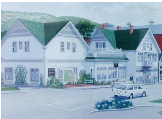
Architectural illustrations should be presented to give an understanding of how new development will fit into the surrounding area.