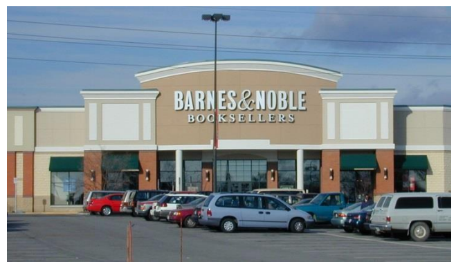
Two examples of large-scale buildings whose mass has been reduced by a rhythmic architectural treatment and subtle changes in geometry. Contrasting vertical elements draw the eye to the entranceways.