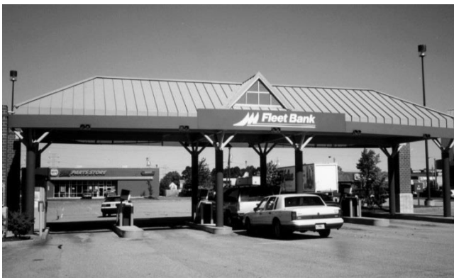
By using the same form and materials the canopy over the drive-through is visually compatible with the main bank building.