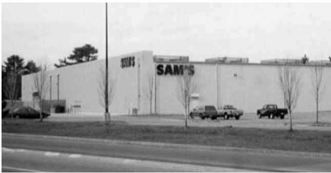
Painted concrete block