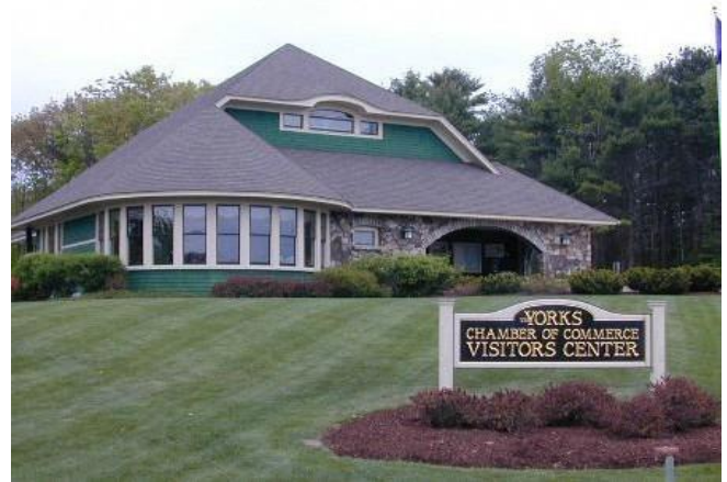
An unusual roofline derived from the shingle style makes a distinctive profile while maintaining a New England aesthetic.