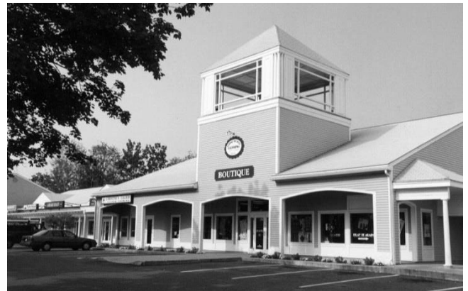
Long commercial buildings should have a focal point and/or an offset in the roofline to break up their mass.