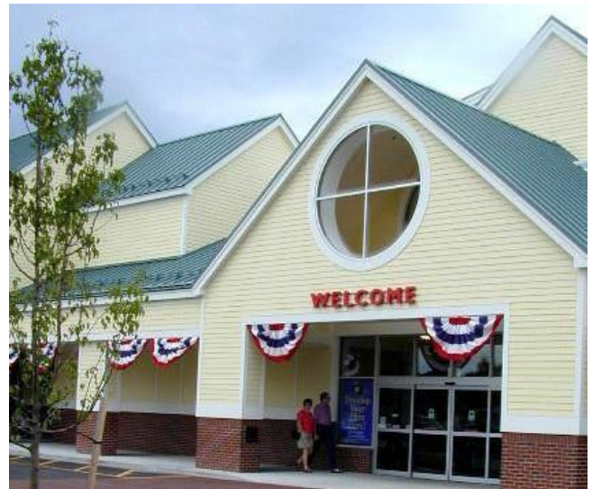
The main entrance to this grocery store is emphasized by the circular window. Brick banding gives visual support to the building while providing protection from snowplows.

Illustrations. Elevations of proposed buildings should be presented with the application for design review. The Planning Board may request perspectives of the building to illustrate the relationship between the front and side elevations. Elevation and perspective drawings should include all landscape elements (trees, shrubs, lighting, street furnishing, signs, etc.) that will be seen in conjunction with the facade.