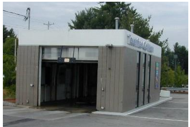
The design of this successful drive-through repeats the same roof pitch, forms, and materials found in the main bank building.