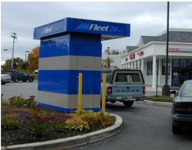
This ATM machine does not relate in form, color, or materials of the adjacent building.