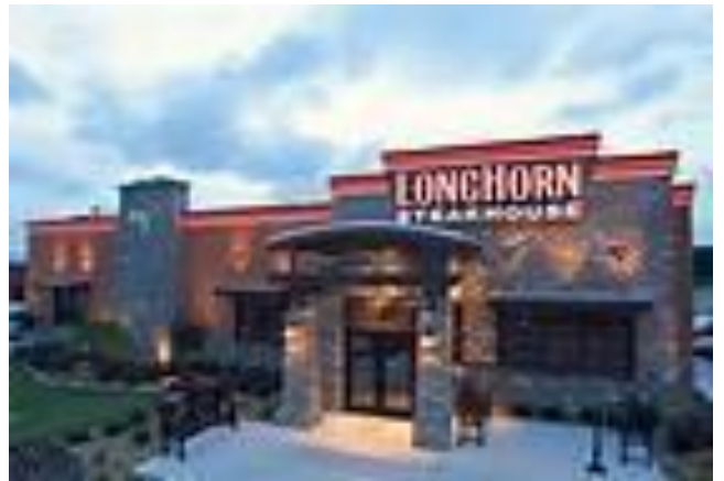
The themed design of this restaurant is out of character in a New England village setting.