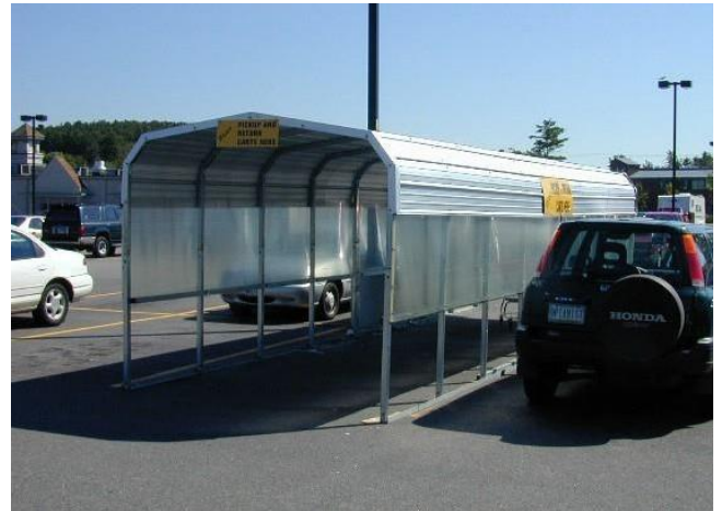
This cart corral does not reflect the architecture of the large retail building and appears out of place in the parking lot.