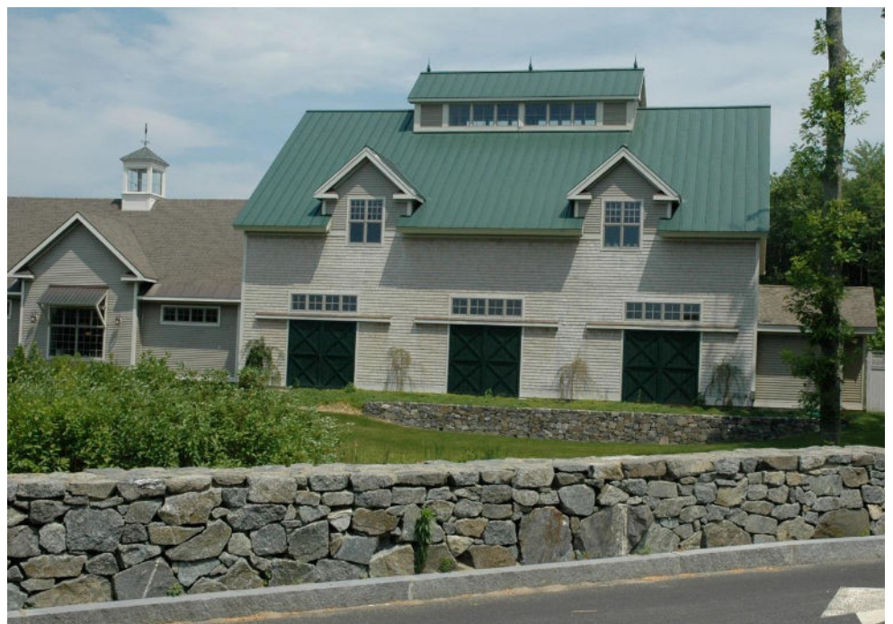
The scale of this large retail building has been reduced through variations in its roof line and roof materials