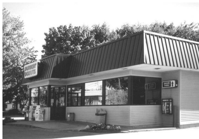
The use of false mansard roofs or vertical panels are inappropriate for rooflines.

Roof Forms. Roofs should have traditional roof designs, such as gambrel, gable, hipped, and saltbox. Non-traditional roof forms – such as false mansard, a-frames, and shed roofs – should not be used as the primary roofline.