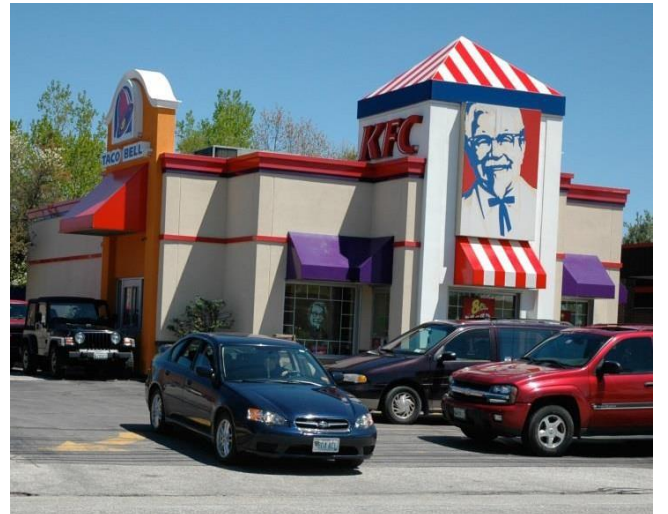
Synthetic stucco (Exterior Insulation and Finish Systems (EIFS))