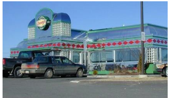
Reflective metallic siding