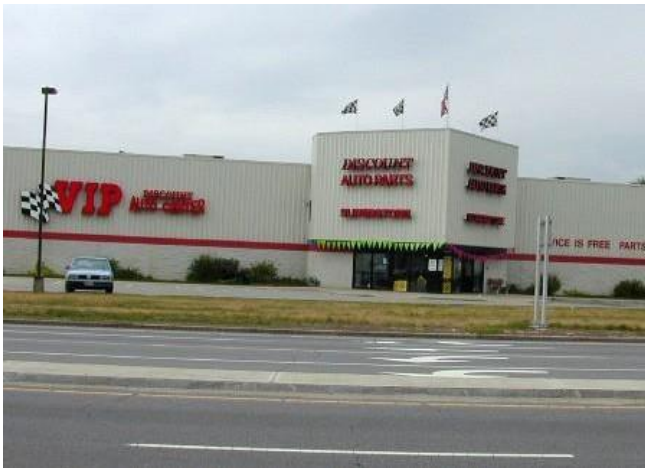
A flat roofed building that is designed as a large billboard with no variations in form to add human scale.