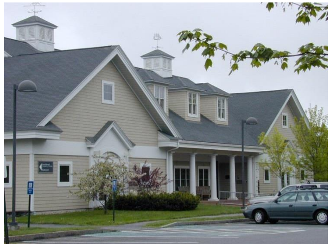
Examples of high quality contemporary Maine architecture – a branch bank, an office building, and a library – that have been designed to fit their uniquesites.