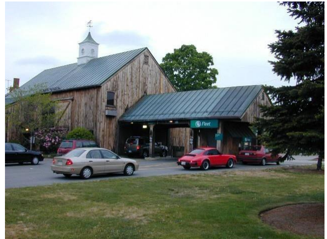
The design of this drive-through bank continues the theme of adaptive re-use and traditional materials.

Location. Drive-throughs should be located at the side or rear of the building and avoid facing the main street, unless there are no alternative for safety or security. Where they are located at the rear, consideration should be given to their visibility to ensure the safety of patrons.