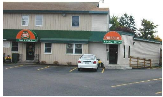
The addition to this restaurant does not relate to the former building materials of the existing structure.

Design. Applications to the Planning Board that involve renovations should show all improvements as well as the existing structure. A narrative should accompany the application which explains the designer's intent to relate the old to new.