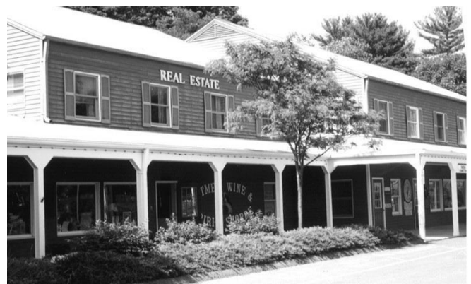
Covered walkways add a shadow line which can reduce the scale