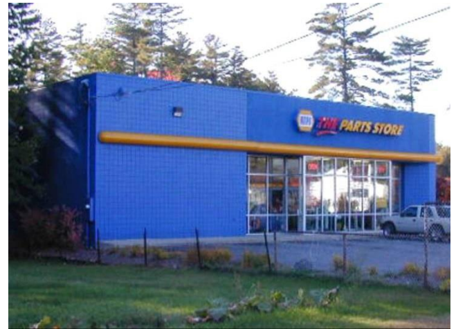
Highly reflective surfaces and bright colors are not characteristic of traditional New England architecture.

Detailing. Arbitrary changes in materials or embellishments that are not in keeping with the rest of the building are discouraged.