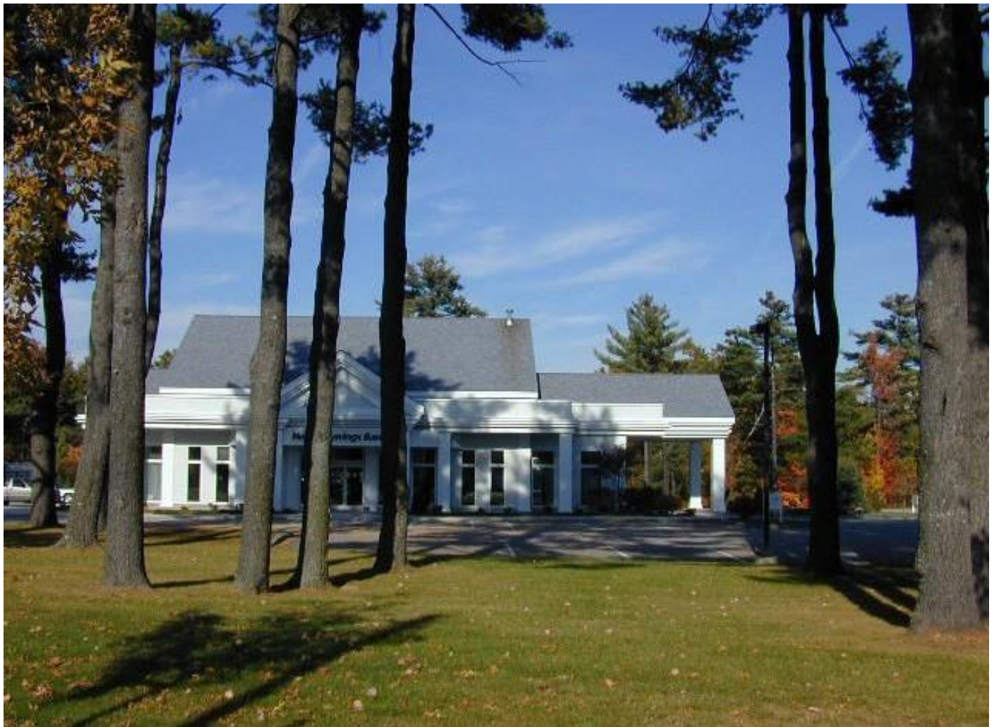
The drive-through window on this bank repeats the same architectural elements used throughout the building.