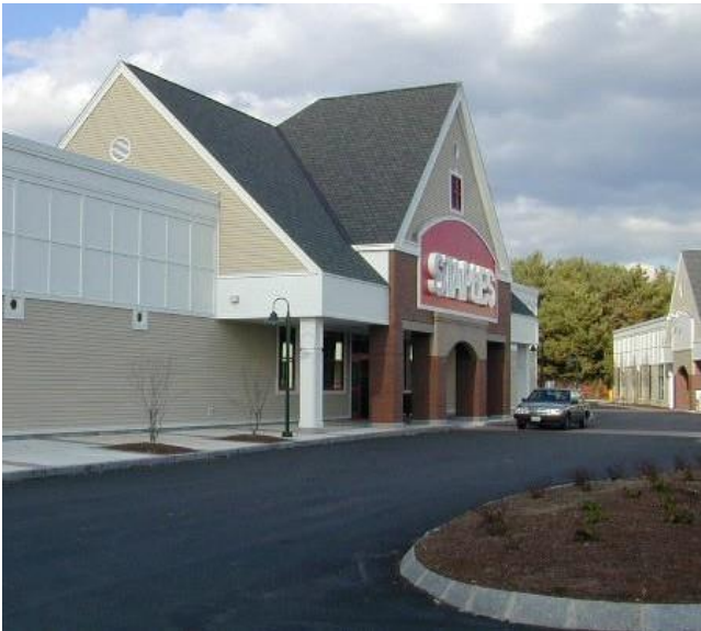
An office supply store in a new shopping center. The design of all buildings feature pitched rooflines, traditional materials, and great attention to architectural detail.