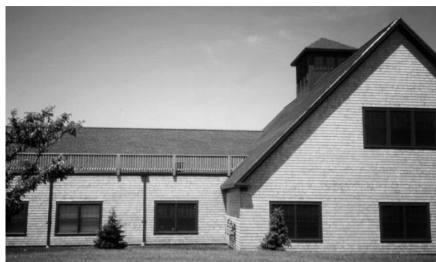
Roof-mounted mechanical equipment has been effectively screened by balustrades.

Shedding Snow and Ice. All roofs should be designed to shed snow, ice, and rainwater in a manner that does not cause a safety hazard or interfere with pedestrians or vehicles.