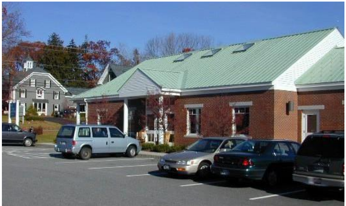
This branch bank uses materials, forms, and details that are common to Maine.