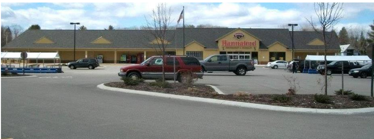
Large retail buildings can be designed to avoid the appearance of a ‘big box’ through careful massing and detailing.