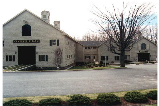
Drawing from traditional forms, the scale of this new commercial building has been effectively reduced by variations in the massing, wall projections, and careful attention to detailing.