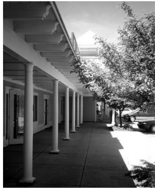
Colonnades effectively add visual interest to linear buildings, while providing scale and protection from the elements.

Covered walkways add a shadow line which can reduce the scale of a long building and unify its facade.