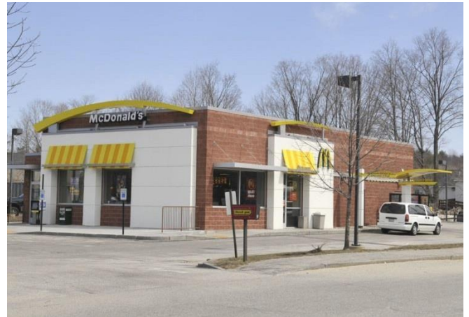
A national franchise that has been designed with a 'kit of parts' approach. The result is a box with applied facade features that has no reference to New England design, and would not meet these Design Standards.