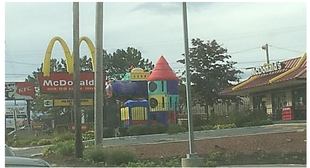
The addition of an outdoor playground bears no relationship to the existing structure.

Coordination of Site Features. As part of the Site Plan application, provide illustrations (including perspective views) of all sides of the proposed building(s). Include all site features and accessory structures (e.g., dumpster screens, storage buildings, refrigeration lockers, playgrounds, vending machines, signage, and lighting) in the illustrations to demonstrate how they are being coordinated with the principle building.