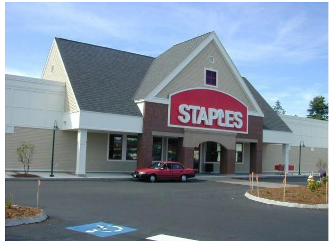
A similar building with a facade composed of New England forms and materials. The overhang provides protection for pedestrians and emphasizes the entranceway. The sign is over scaled (i.e., too large) for the facade.